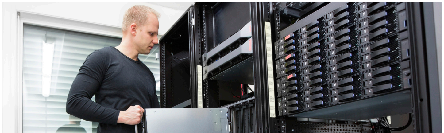
Goodwill South Florida Defends Data Against the Future Threat of Hurricanes with Cloud-Based Data Recovery